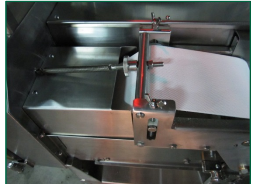
Upper hold down belt