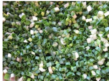
Diced Green Onions