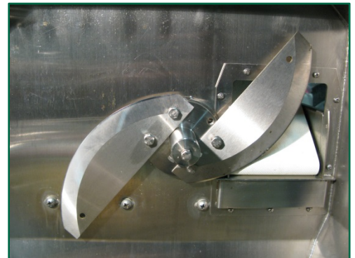
Razor Edge - Clean Cuts