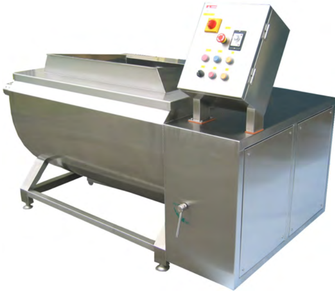
Basket in wash position