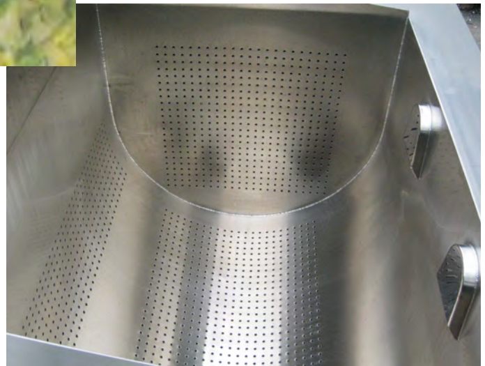
Perforated wash basket with agitation jets