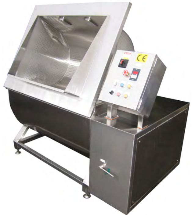
Basket in dump position